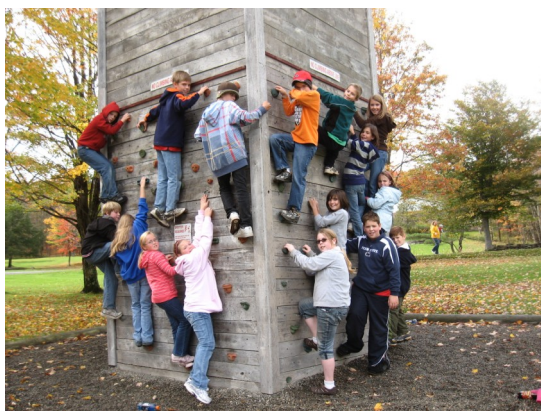
Just “hanging out” at the Fall Overnighter!

The month of September is a month of transition: Shifting from summer schedules and week long camps, to overnight retreats and looking ahead to the winter season. We had the opportunity this past week to have 10 men from the Scranton Rescue Mission serve with us, working on repairing water lines, planting trees at the tubing hill, and digging ditches for better drainage around full time staff housing. The work of volunteers makes a HUGE impact here at RMBC, and we appreciate those who are able to partner with us in that way. Looking ahead to the next month we are excited for three more weekends of fall retreats—including our 3-6th grade Fall Overnights, as well as all of the tasks that come with the Fall Season at camp—covering the pool, raking leaves etc. Thanks for partnering with us in prayer this month!